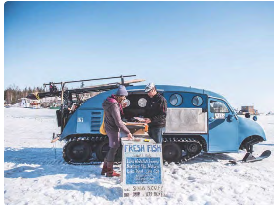
Fresh Fish For Sale

Objective 4.3: Support farmers markets in public spaces.