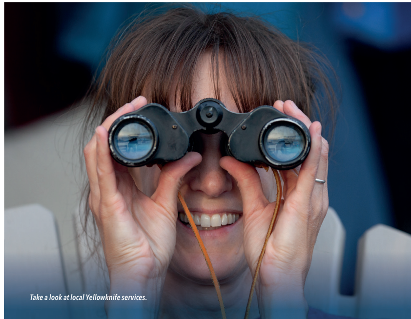
Take a look at local Yellowknife services.