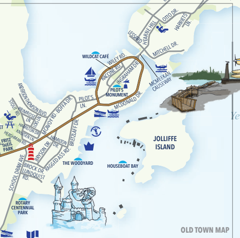
OLD TOWN MAP