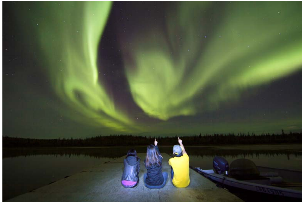
Top Pix