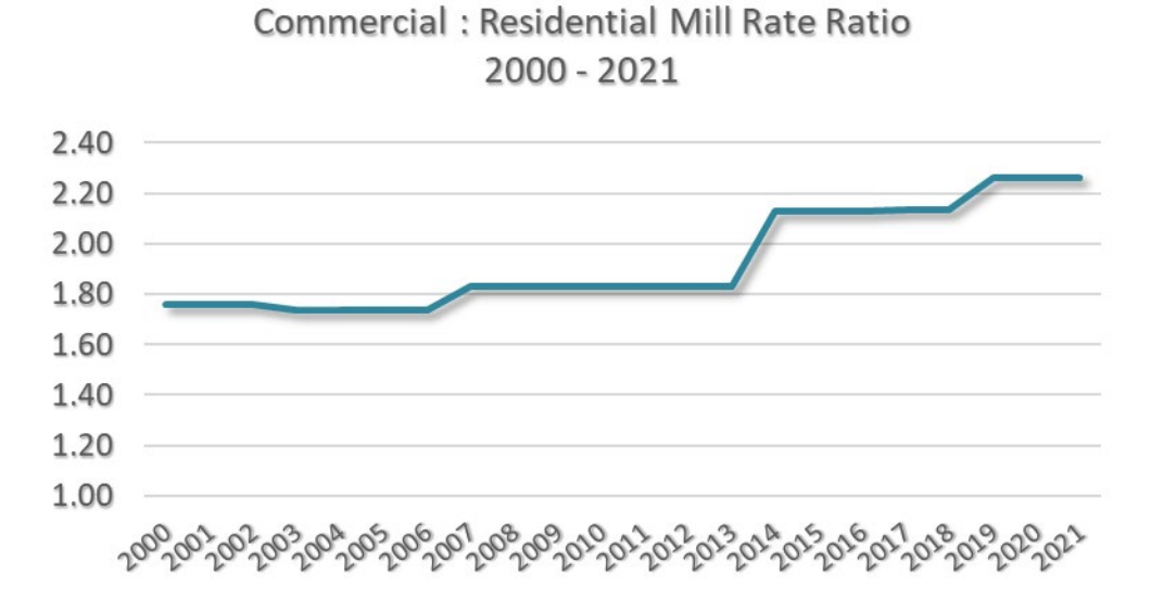
Chart II shows the mathematical ratio of the Commercial mill rate to the Residential mill rate for each year from 2000 to 2021.

Residential properties. The black lines show the same information for Residential properties. As expected, the percentage of taxes contributed by each group is closely correlated to its proportion of the assessment base.